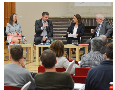
Evening discussion: "How much democracy does Europe need?"