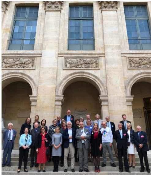
Members of the Leopoldina and the Académie des Sciences spoke on the relationship between human rights and education.

In scientific presentations and discussions, members of the delegations from both countries as well as a number of other interested attendees debated ethical aspects of human rights education, the role of human rights in science and the defence of persecuted scientists. They went on to discuss immigration and diversity in the