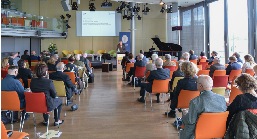
The celebratory symposium in honour of the naturalist Alexander von Humboldt was held at the Akademie der Künste (Academy of Arts) in Berlin.

Accompanying Alexander von Humboldt to Russia and Central Asia