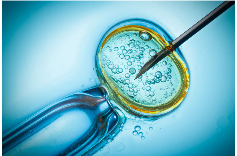
New legislation is needed to regulate reproductive medicine.

• Medical practitioners in many different countries follow guidance based on the latest international research findings and only implant the single most viable of the embryos available. This elective single embryo transfer avoids multiple pregnancies, which are risky for both mother and babies, without appreciably reducing the individual's chance of becoming pregnant.