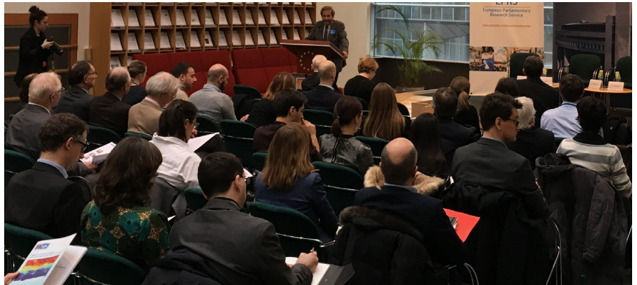
In Brussels, the European academies encouraged policymakers to demonstrate persistence in working towards climate targets.

According to EASAC's report, many climate models are overestimating the capacity of NETs to help achieve the key goal of the Paris agreement: to keep the global temperature rise, measured against pre-industrial levels, to below 2 degrees. This does not, however, mean that conducting research on NETs (new technologies for removing carbon dioxide from the atmosphere) is no longer considered worthwhile. But the findings have prompted