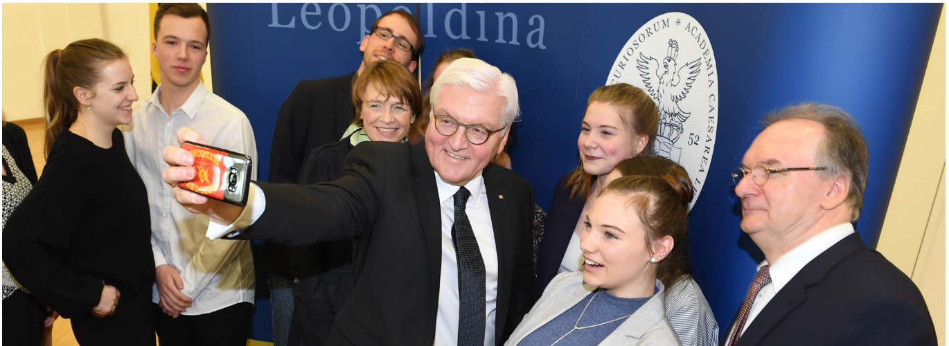
Pupils at the Hans-Dietrich-Genscher-Gymnasium grammar school in Halle gave German Federal President Frank-Walter Steinmeier, Elke Bündenbender and Minister-President Reiner Haseloff insights into their lives in the digital world.