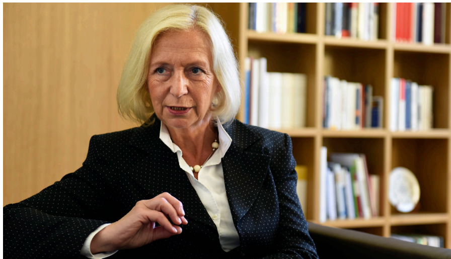
Federal minister Johanna Wanka believes that a great tradition and a high level of acceptance in the scientific community are what set the Leopoldina apart.