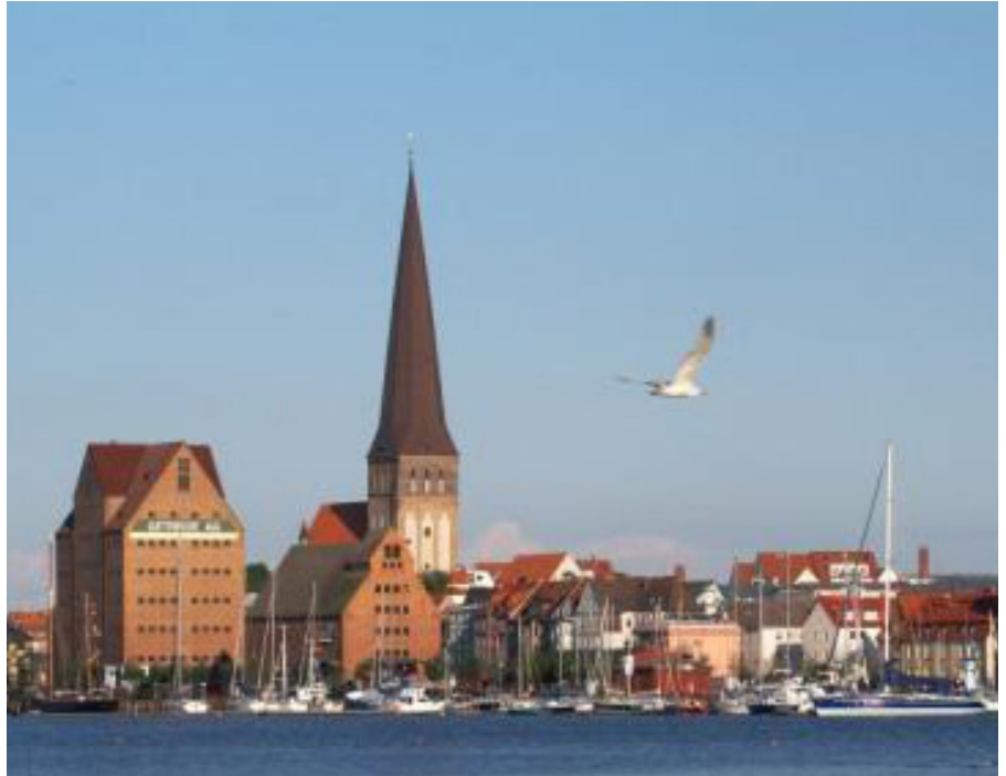
The 2014 Annual Assembly takes place in Rostock.