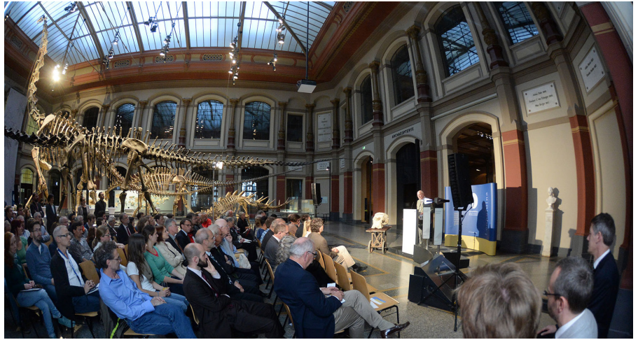
The report on "Challenges and Opportunities of Integrative Taxonomy for Research and Society" was presented in the dinosaur hall at Berlin's natural history museum on 25 June.

In the report, the academy recommends using the new opportunities of taxonomy to the full – for example, to describe all the species of Central Europe. The authors would like to see more investment in taxonomic research and teaching. "Taxonomic research in Germany has an excellent reputation worldwide. If we are to continue to pursue cutting-edge research in this important area, it must become a priority at the most capable research institutions, networking and in-