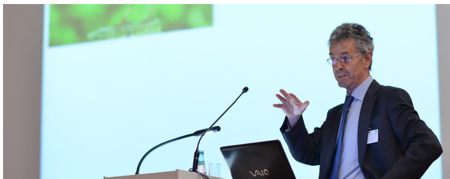
In his Leopoldina Lecture “Do science and politics mix?”, Lord John Krebs came to the conclusion that not only do they mix, they in fact often depend on one another.

cular group of voters whom he or she must represent appropriately. This means that alongside the scientific facts, very varying interests play a major part in a pluralistic political decision-making process.