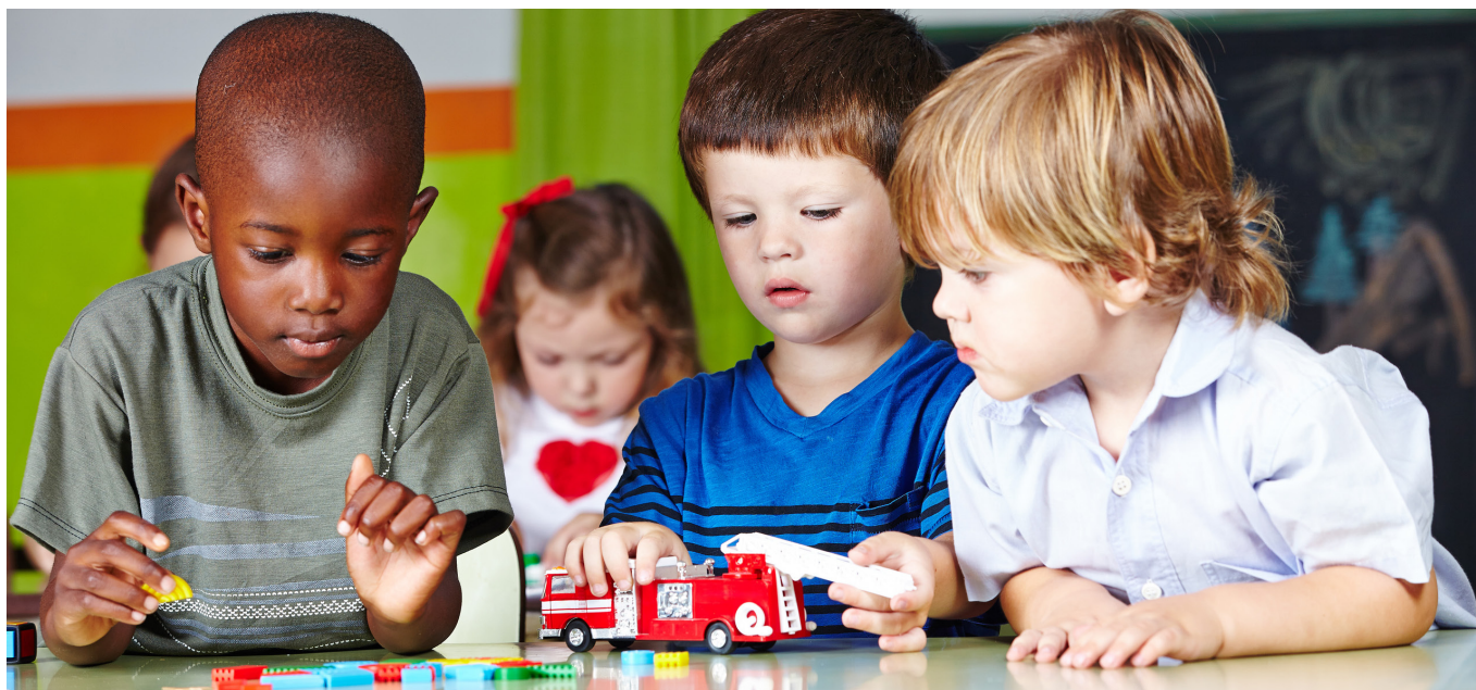
It is sensible to invest in high-quality education and upbringing of young children.