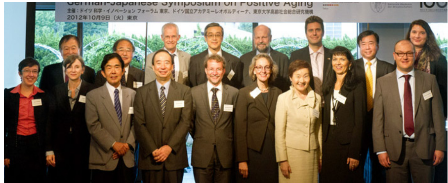
Speakers, chairs and organisers of the symposium, Tokyo 2012.

The symposium was attended by approximately 200 people, both from the scientific and business spheres and from civil society. It was designed to give researchers from Japan and Germany the chance to present and exchange their findings from research into aging. For the organisers, the event was a logical