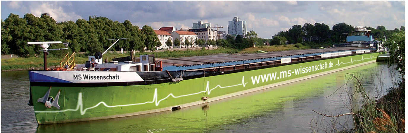
The "MS Wissenschaft" will be travelling along German rivers again starting 19 May. Stops are planned in 35 cities. For the first time two exhibits by the Leopoldina will be aboard.