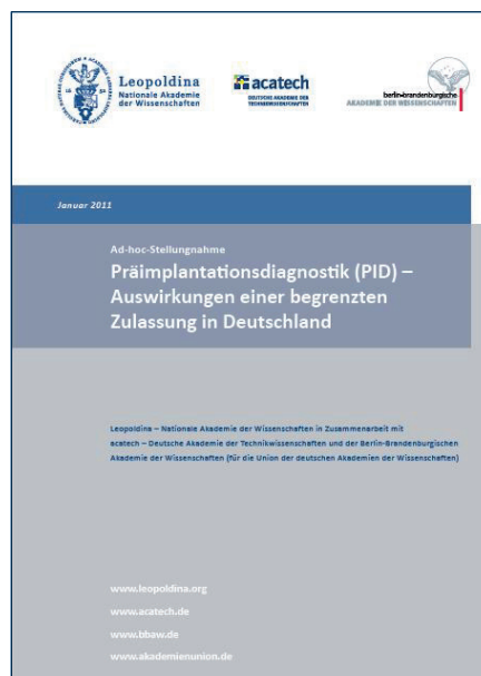
Title page of the Ad-hoc statement on PGD

On 18 January the Leopoldina publicly issued and published an ad-hoc statement on preimplantation genetic diagnosis (PGD). This was done in conjunction with acatech – the German Academy of Science and Engineering, the Berlin-Brandenburg Academy of Science and Humanities (BBAW) and by the majority of the academies belonging to the Union of German Academies of Science. The underlying message of the statement: PGD is to be placed on an equal footing with prenatal diagnosis (PD) by lawmakers and access should be given in Germany under certain conditions to those women affected. This prevents having to terminate pregnancies where the embryo is severely affected by hereditary disease.