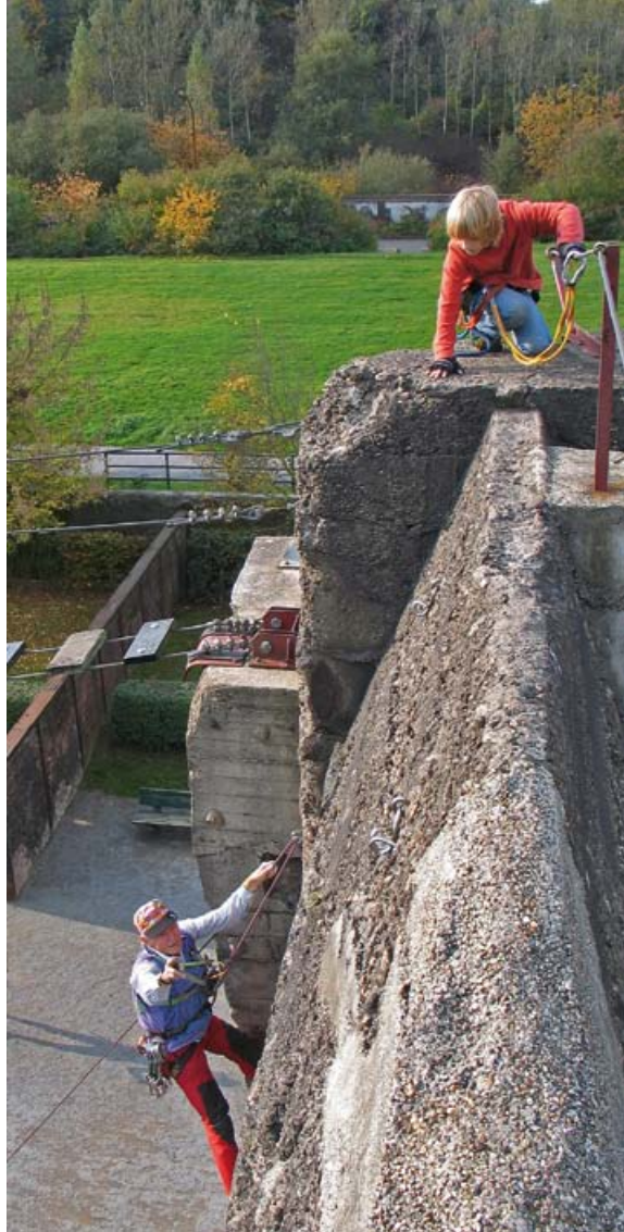
Horst Neuendorf Climbing with 8 and 80, 2008