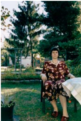
Daniela Risch Untitled, from the series “Helga”, 2008, 3 rd place