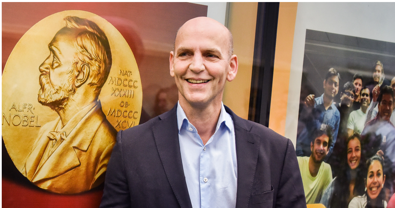
Benjamin List is one of the directors of the Max Planck Institute for Coal Research.

Catalysis researcher has been honoured together with British scientist David W.C. MacMillan