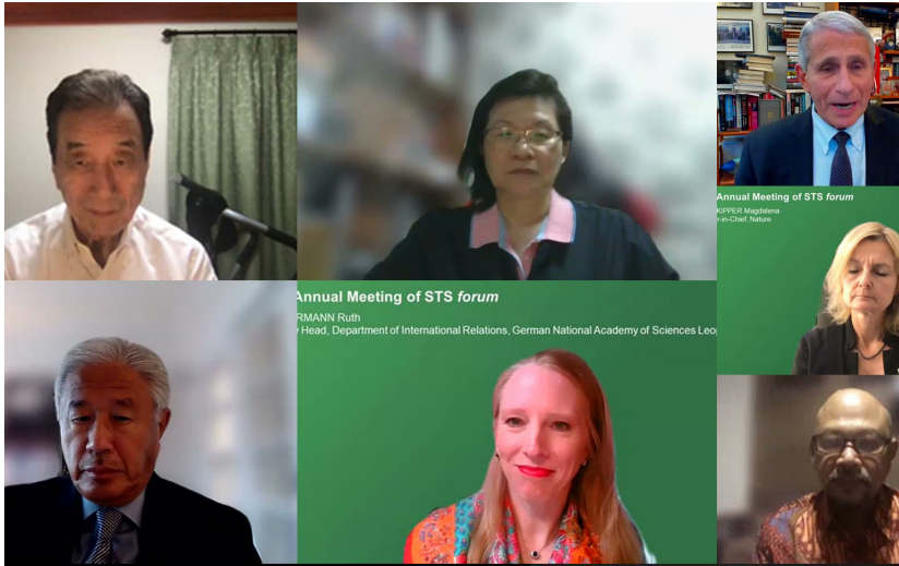
US immunologist Anthony Fauci (top right) joined one of the central panel discussions at this year's Science and Technology in Society Forum. He and his fellow experts discussed their experiences of dealing with global pandemics.

Looking ahead to the G7 summit 2022 in Germany