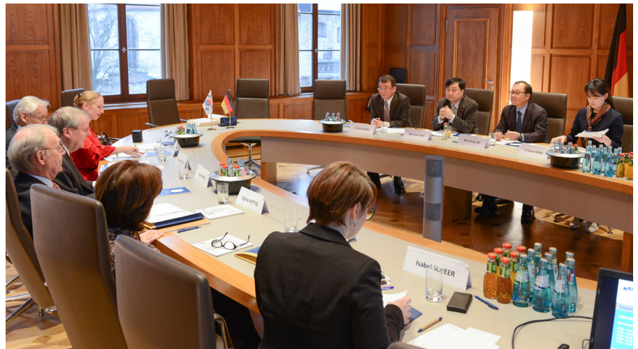
Representatives of the Korean Academy and the Leopoldina held intensive discussions about the future focus of their collaboration..

All were in agreement that the societal relevance of projects should play a