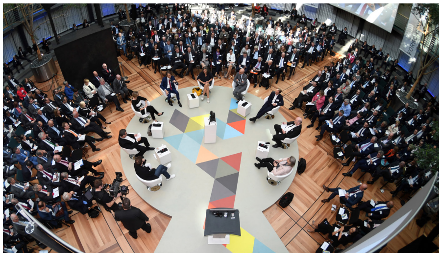
As shown here in 2018, debates at the Research Summit are designed as open forums that give the experts involved a great deal of scope.

2019 Research Summit to discuss key technology