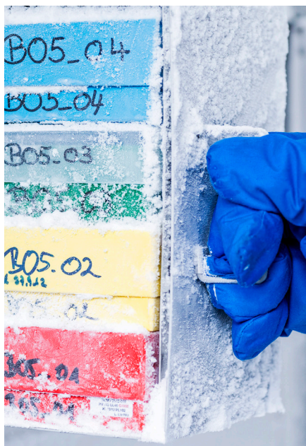
Samples of viral pathogens that could attack a weakened immune system following a bone marrow transplant are stored at minus 140 degrees Celsius.