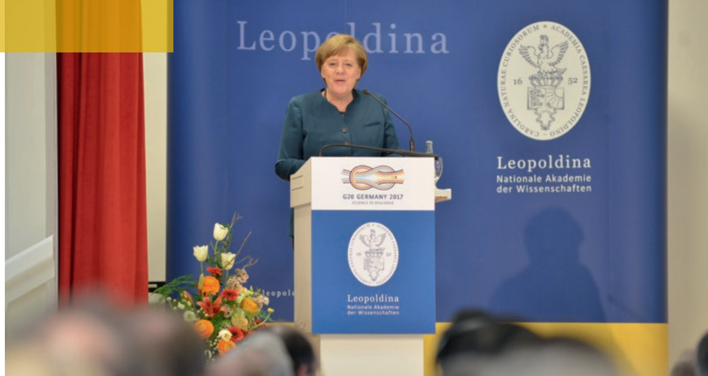
The then chancellor Angela Merkel at the Science20 Dialogue Forum 2017.