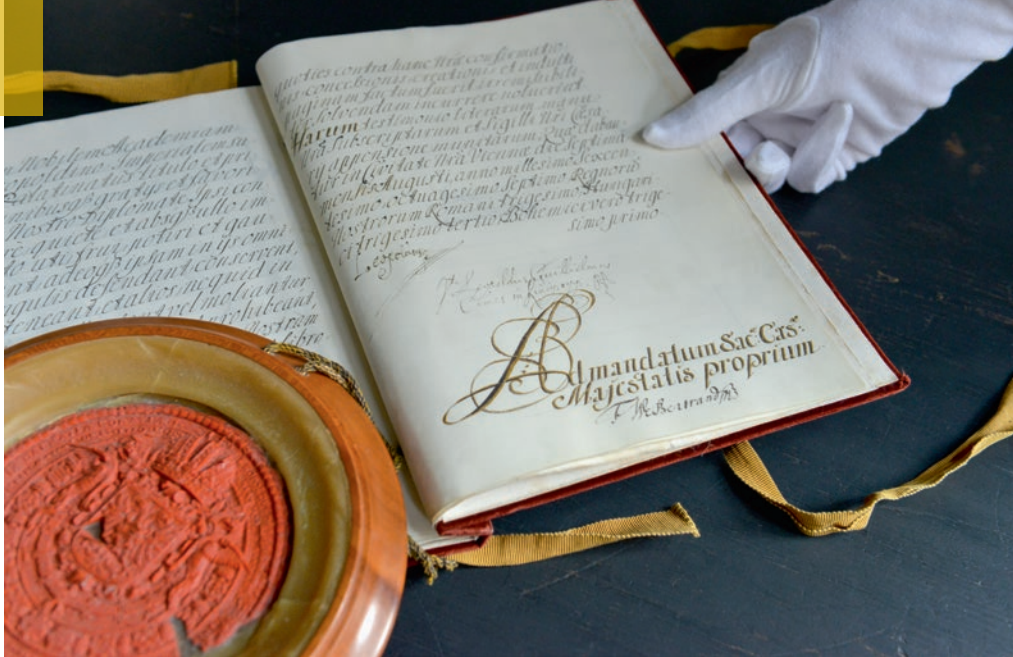
The charter with which Kaiser Leopold I awarded the academy special privileges in 1687 is made of bound parchment with red satin binding and an imperial seal.