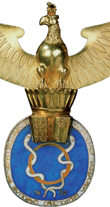
Leopoldina members and the city of Schweinfurt donated this president's chain of office to the Academy in 1955.

The Academy is a registered non-profit association. It is financed by public funds from the Federal Ministry of Education and Research (80 %) and the state of Saxony-Anhalt (20 %), where its main office is located. The Executive Board is comprised of the President and four Vice Presidents. The Presidium is additionally complemented by other members and bears responsibility for all Leopoldina's activities. A full-time Secretary General heads the office and is supported by the administration.