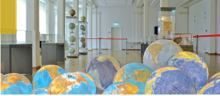
▲ The Centre for Science Studies staged an exhibition of globes that showed how our view of the Earth, the moon, and other planets has changed since the early modern age.