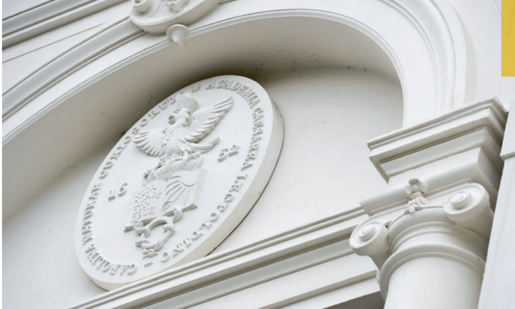
A relief of the Leopoldina emblem adorns the front door of the Academy building in Halle (Saale).