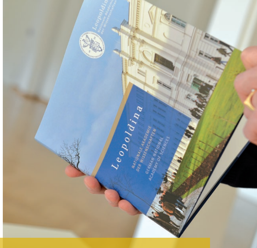
The Leopoldina's Illustrated Book provides a comprehensive overview of the National Academy.

Leopoldina publications are available in the digital library at: www.leopoldina.org/en/digital-library .