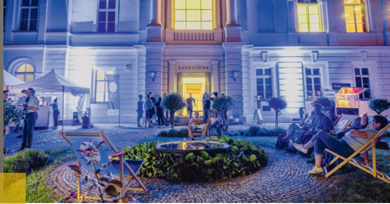
▲ At the Leopoldina Night 2023, visitors had the opportunity to experience a deep-sea lounge, a science slam, a scientific puppet show, and a commons debate.